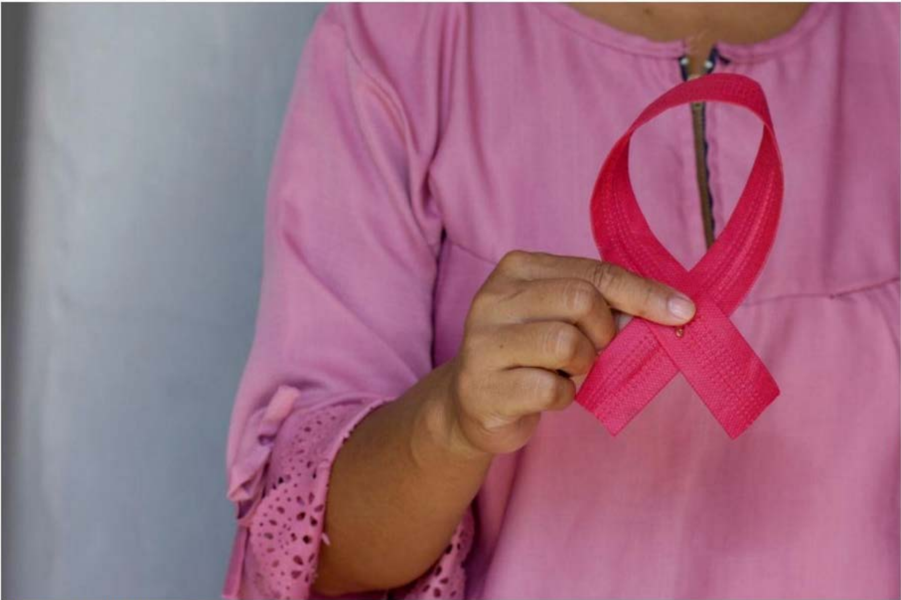
Self-Care to Prevent Breast Cancer